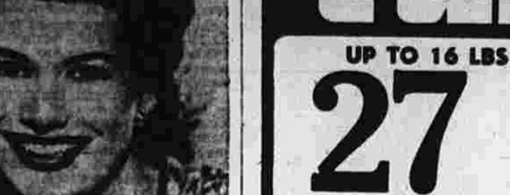
Audience laughter hits a new high at the Circle today, according to report. And it's all due to the fact that Joe K. Brown, one of the screen's most popular comedians, plays a dual role in his latest hilarious hit, Columbia's 'So You Won't Talk'.

The Spanish ambassador to the U.S. government, Joe Felix Lequerica was reported here today to be in Paris taking part in French-German discussions on collaboration. It was said he might see German Foreign Minister Joachim Von Ribbentrop.